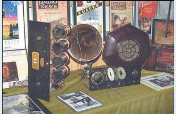
A display of receivers from the 1920s. Finding parts for some old sets can be a real challenge.

The Bakelite cases of most radios were brown or occasionally cream. Some manufacturers did produce a variety of cabinet colours, either as mixes in the Bakelite or as a painted cover. These coloured sets are highly sought after, particularly blue ones which tend to sell for up to three times the price of a brown set. A number of these can be seen in one of the photographs.