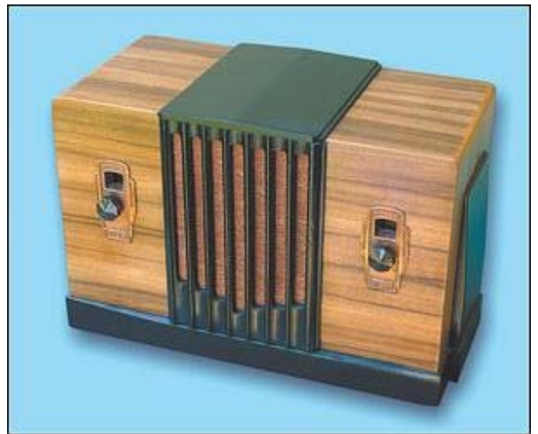
The Airzone 500 came in a stylish cabinet and has just two controls: volume and tuning. The control settings are visible through "peep hole" escutcheons.

valves such as the 2A7 and later clones had not appeared commercially on the scene at the beginning of the 30s. To get around this problem, ingenious circuit designers developed the autodyne converter. This provided a local oscillator and achieved radio frequency (RF) amplification and conversion to the intermediate frequency (IF) all in the one pentode valve.