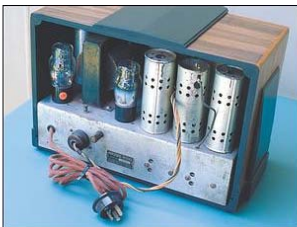
This view shows the rear of the cabinet, with the chassis in place. Loosening two screws underneath the cabinet allowed the chassis to slide out for servicing.

A number of sets also included a "Local/DX" switch. This allowed a further reduction of receiver gain when strong stations were being received. On Fig.1, the switch is shown in series with R2 (155W) - ie, the 155W resistor was switched into circuit in the "Local" position, when strong signals were present. However, the receiver featured in this article does not have this facility.