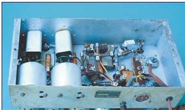
The component layout under the chassis is generally uncluttered but note that the coils sit over the top of three of the valve sockets. This makes it difficult to access components around these sockets for servicing. The IF adjustments are accessed through holes in the rear apron of the chassis.

The cabinet was in reasonable condition, so not a lot of work was required here. First, paint stripper was used to remove all existing varnish and paint from the cabinet. The trims were then spray painted black, as was the inside of the cabinet (quite a lot of cabinets during that era were painted inside). Finally, the cabinet was finished off with satin/semi-gloss clear pre-catalysed lacquer spray.