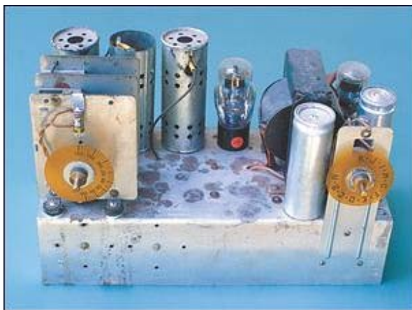
The components on the top of the chassis are all easy to access. The two 8 \mu F electrolytic capacitors near the power transformer were replaced but left in-situ on the chassis to keep the set looking as authentic as possible.

The power cable was replaced with a modern 3-core fabric covered cable. It looks the part and has the vital earth wire which is sensible to have in sets of this age.