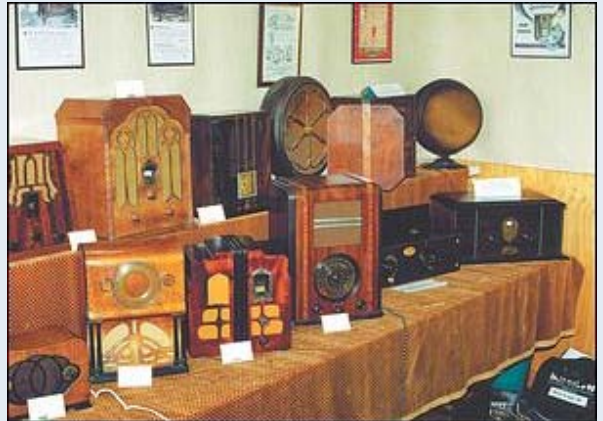
These early radios all have one thing in common: attractive wooden cabinets. These have all been restored to "as-new" condition.