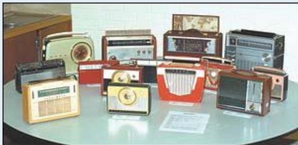
Early portable transistor radios are now very much collector's items. These have all been fully restored.

The display was the best I've ever seen of this nature. The equipment was in immaculate condition and must have impressed the general public as well. The military equipment naturally didn't look anywhere near as "pretty" as the domestic radios, being more in keeping with its intended role. There were people around who could answer the questions of the visitors so that all knew more about our radio history than before they came to the display.